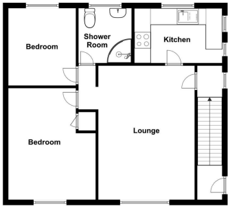
© Essex EPCs This floor plan is not to scale and is for illustrative purposes only. We make no guarantee, warranty or representation as to its accuracy and completeness.